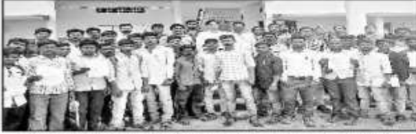
ఎయిజెసెస్ అభ్యర్థులతో అధ్యాపక బృందం, ఇతరులు