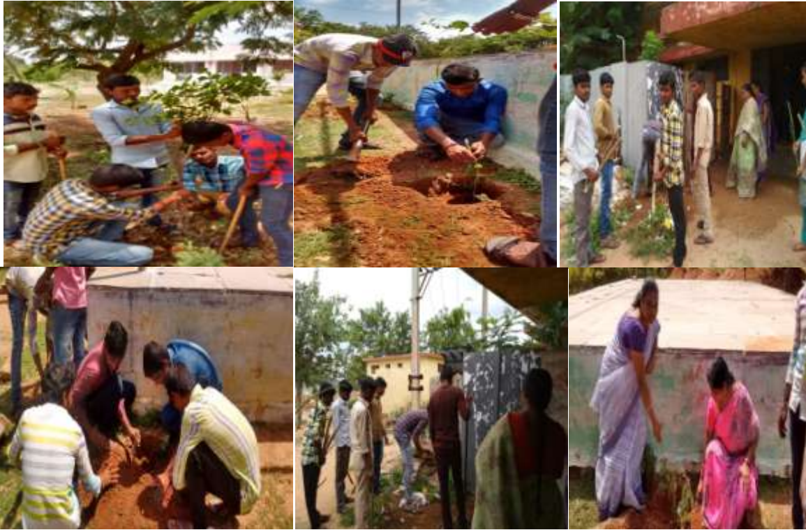
c. Medicinal Plant Garden and collecting seed variety: An initiative taken up by the dept. of Botany and SML Garage - The Campus Green Corps in the year 2018-19. This initiative contributes to the expansion of the already green campus