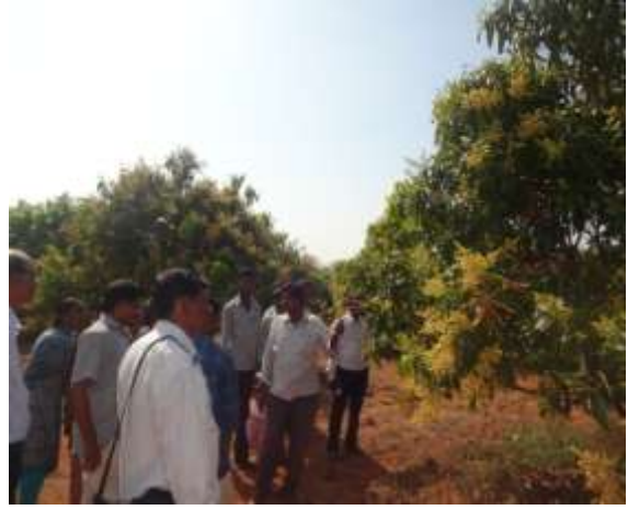
Plant collection Programme