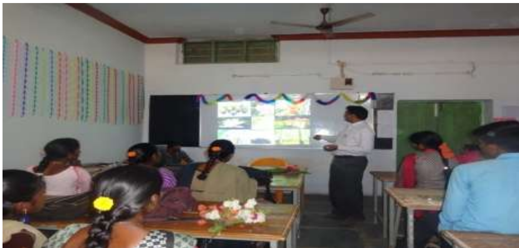
ICT enable Teaching environment