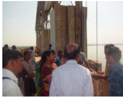
Field trip to Gajualadinne Project