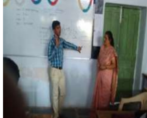
ICT based Student Seminar on DNA Replication